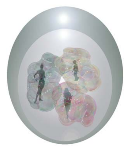
Fig 2. An Invisible Network -- Aura around Persons

The main idea seen here is breaking this humongous number of devices into smaller groups based on the aura and the vicinity and/or approximate and opportunistic services (refer to finger print authentication using a scanner). We believe this reduces a lot of traffic, and enables searching for services that is most natural (as humans do). Since the aura should start growing, mimicking the person, there will be business opportunities for service providers to keep updating the intelligence in the individual aura which would be retrieved whenever required. The approximation, opportunism and cognition and cooperation are the key elements for this future pervasive service provisioning.