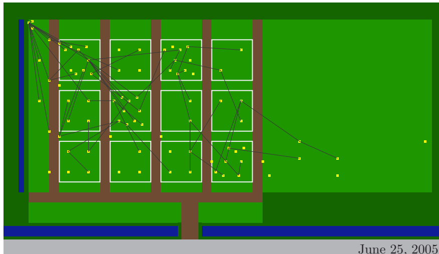
Figure 3. Reconstructed spanning tree; it is incomplete due to missing packets containing first-hop data.

was decided to go to the deployment site (a three-hour car drive from Delft) to see if we could put together a working system consisting of 5 sensor nodes and a gateway. We could not, for a number of reasons. First, the casing of the gateway was made by the partners from Wageningen, and we soon discovered that they used a different WaveLAN card for connecting to the backbone network. Our card, capable of connecting to an external directional antenna, was slightly larger than theirs and would not fit into the casing without relocating the mounting brackets of the main Stargate board. Note that we did communicate the dimensions of the WaveLAN card, but forgot to include room for the connector of the external antenna. The second problem that surfaced had to do with the sensor nodes. Four out of five nodes could not read the T/RH values. This turned out to be caused by a difference in the wiring of the cable connecting the microclimate sensor and the TNodes board; the specification of the connector on the PCB was mirrored, so only the cable supplied by TNO was working. Finally, we discovered that the antennas were quite fragile and would come loose easily when inserting them into the plastic casing. In short, time ran out on this day and we never got a TNode to report any data back to Delft, but we did manage to get the IP connection over Wi-Fi to work.